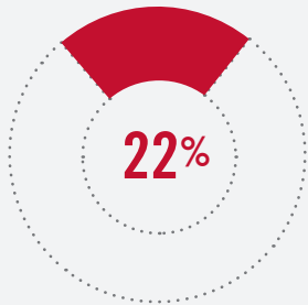
Women 15 to 24 years old

Younger women have limited access to contraceptives; older women still have unmet needs